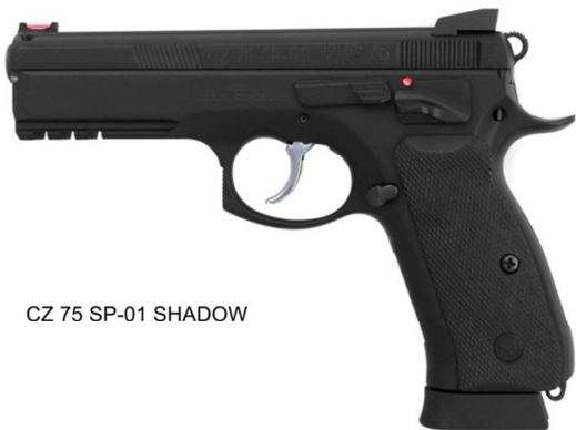
CZ 75 SP-01 SHADOW